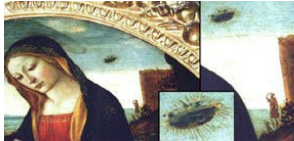
"The Madonna with Saint Giovannino", 15th century by Domenico Ghirlandaio (1449-1494), Loeser collection at the Palazzo Vecchio.

ventilation shafts. Mummies don't breath, and the outside air would have accelerated the deterioration of a mummy. Of course no mummy was ever found in the great pyramid or any other pyramid in Egypt, making that a moot point. The shafts do however point to heavenly locations, which it is believed the builders of the pyramids had great knowledge of.