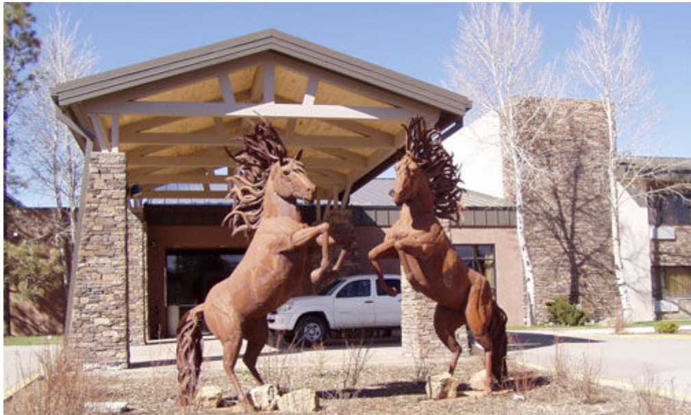
Best Western Jicarilla Inn & Wild Horse Casino

A few other incidents occurred that were not scheduled as part of the conference. A few minutes before 6 AM on the morning of the conference, I along with most other people in Dulce for the conference, and staying at the Jicarilla Best Western Inn, were awakened by the sound of at least one helicopter very low over the motel. Later it was learned that this was not normal, and no one knew where the helicopter(s) came from, whom they belonged to, or what they were doing so low over the motel. Apparently helicopters are not totally unusual in the area, but flying that low was unusual according to the locals who also heard it. It seemed to be a concern of some at the conference later that day.